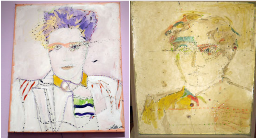
Rufus Wainwright- Metaphysical Portrait Metaphysical Portrait Light box by Colette by Colette